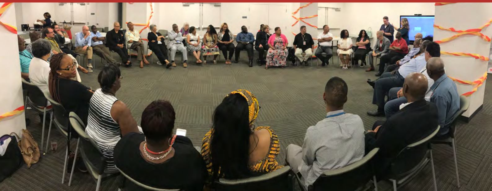
Full-time faculty participated in a team building and course management training during Faculty Professional Development at 801 North Capital Street NE on Thursday, Aug. 16.