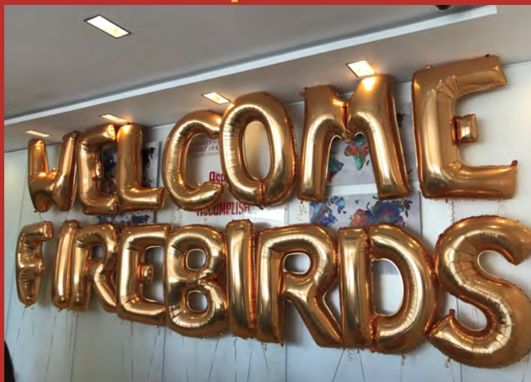
Students were met with a warm welcome sign at the entrance of 801 North Capital Street NE.